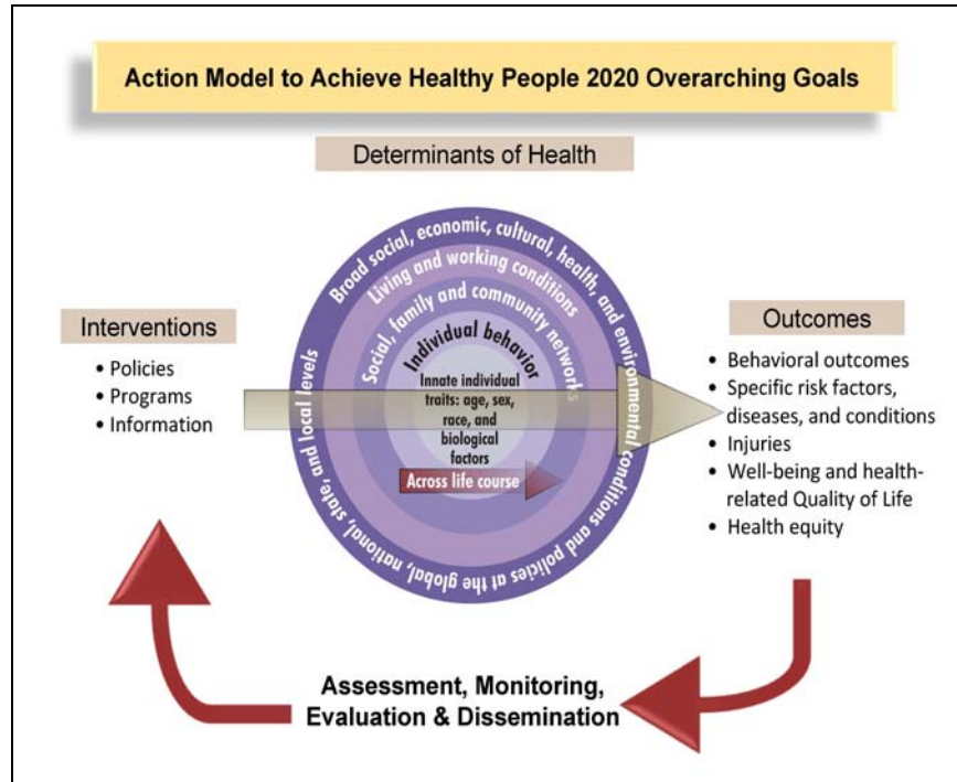
Exhibit A. Action Model to Achieve Healthy People 2020 Overarching Goals

To close the gap between where we are now as a nation and where we would like to be by the Year 2020, Healthy People 2020 must provide clear priorities for action (i.e., it should articulate “what” needs to be done) and focused strategies for addressing them (i.e., it should explain “how” this work should be carried out). The summary below highlights the Advisory Committee’s suggestions for each of the overarching goals in both of these areas.